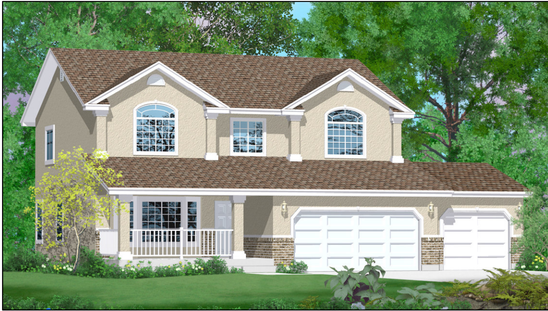
Optional 3rd Car Garage Shown