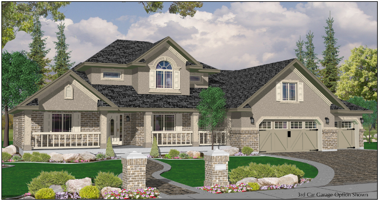
3rd Car Garage Option Shown